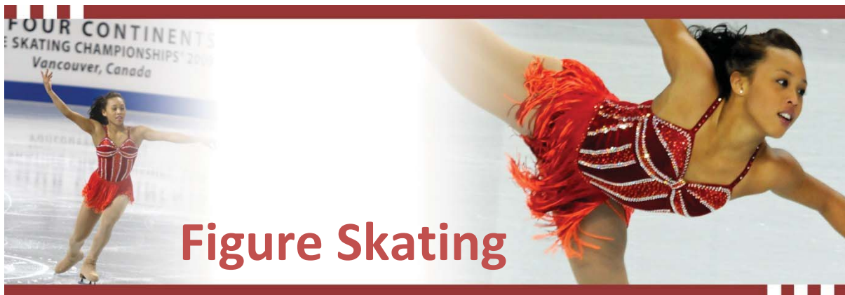
Figure Skating is an individual scholarship program.

The scholarships are issued to leading Australian athletes and divided into funding levels based on likely qualification for selection to the next Olympic Winter Games team.